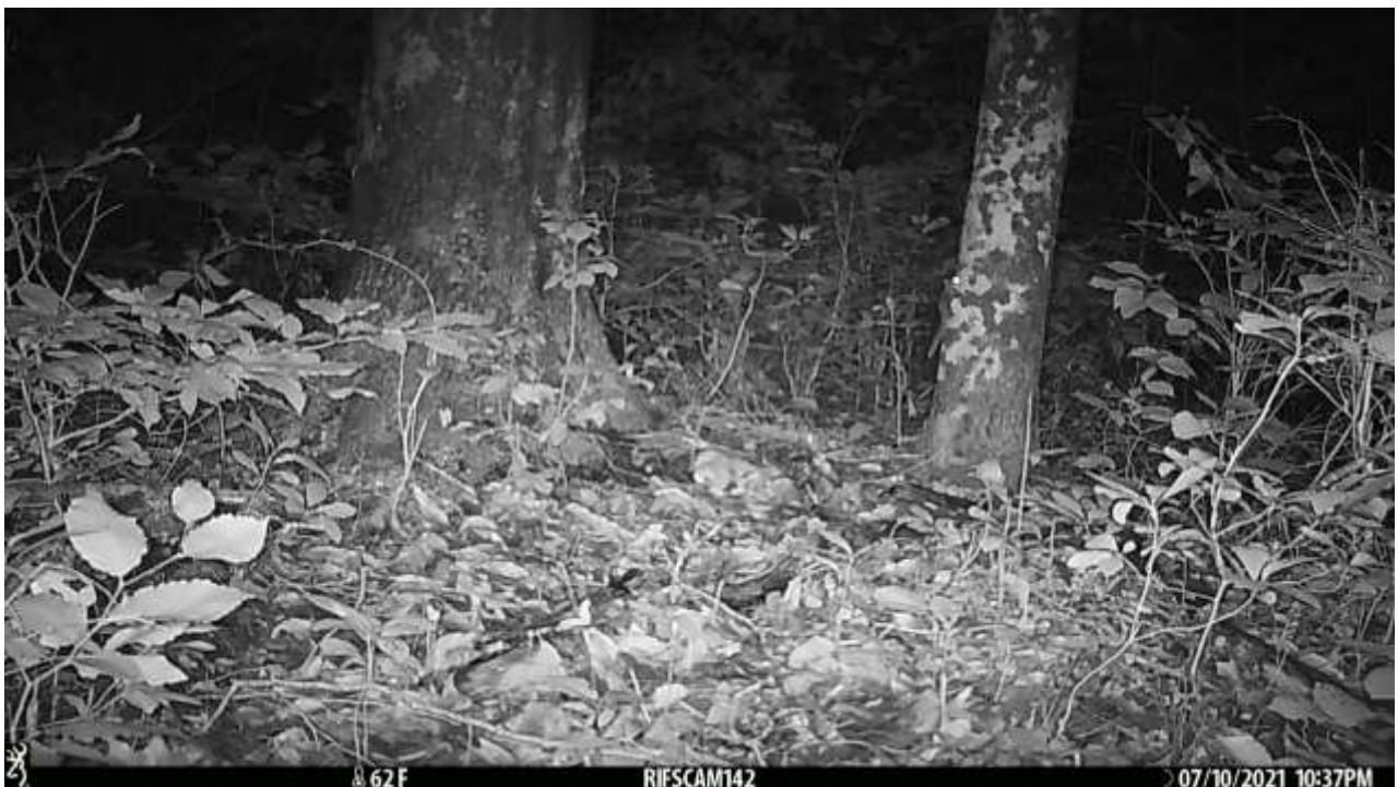
Flying squirrel (hint: on the smaller tree on the right ~1ft off the ground)