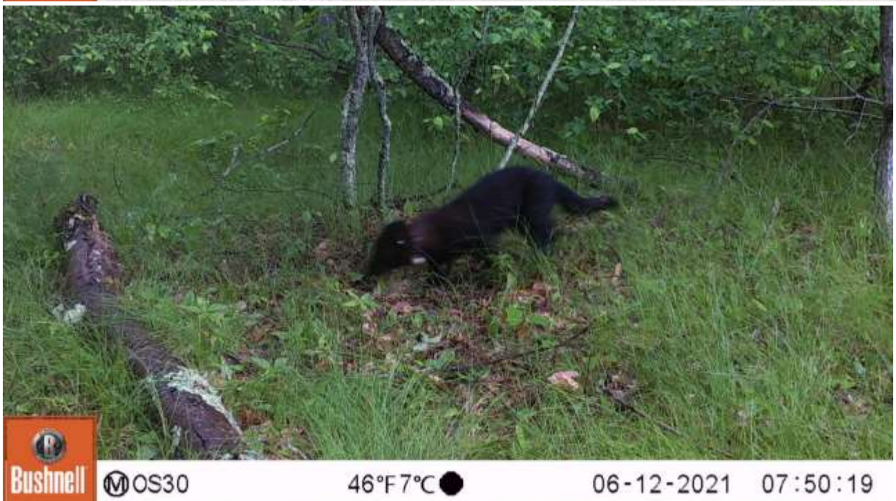
Collared subadult male fisher (Freddie – M03)