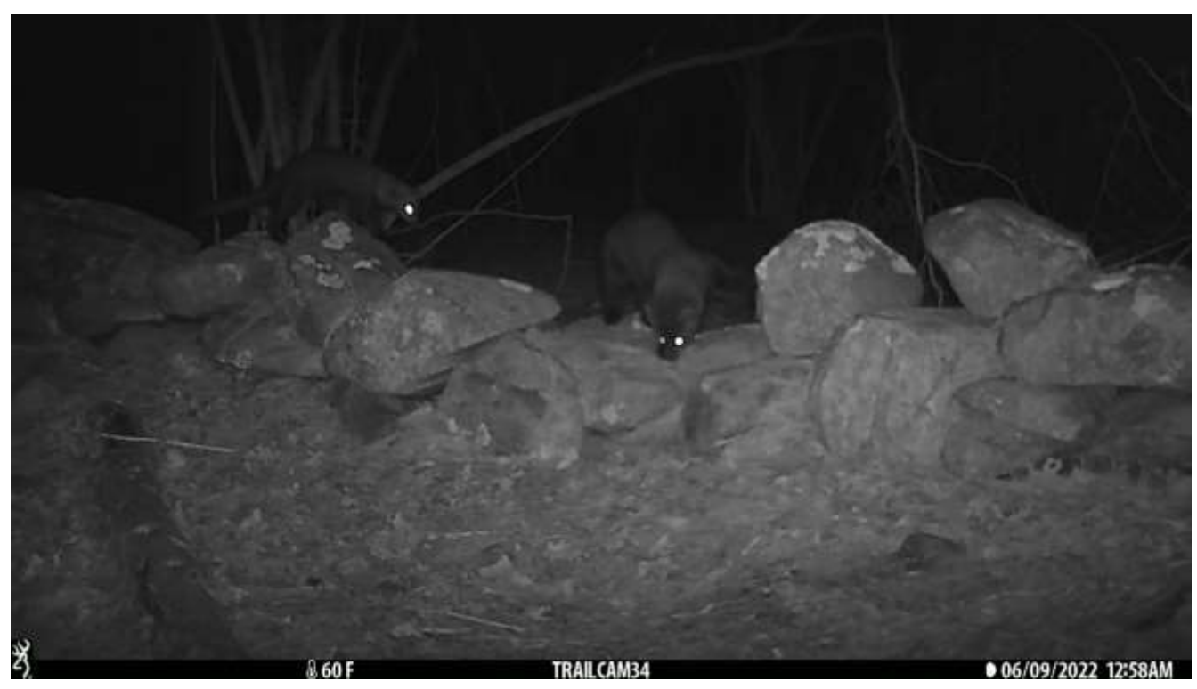
Two male fishers again