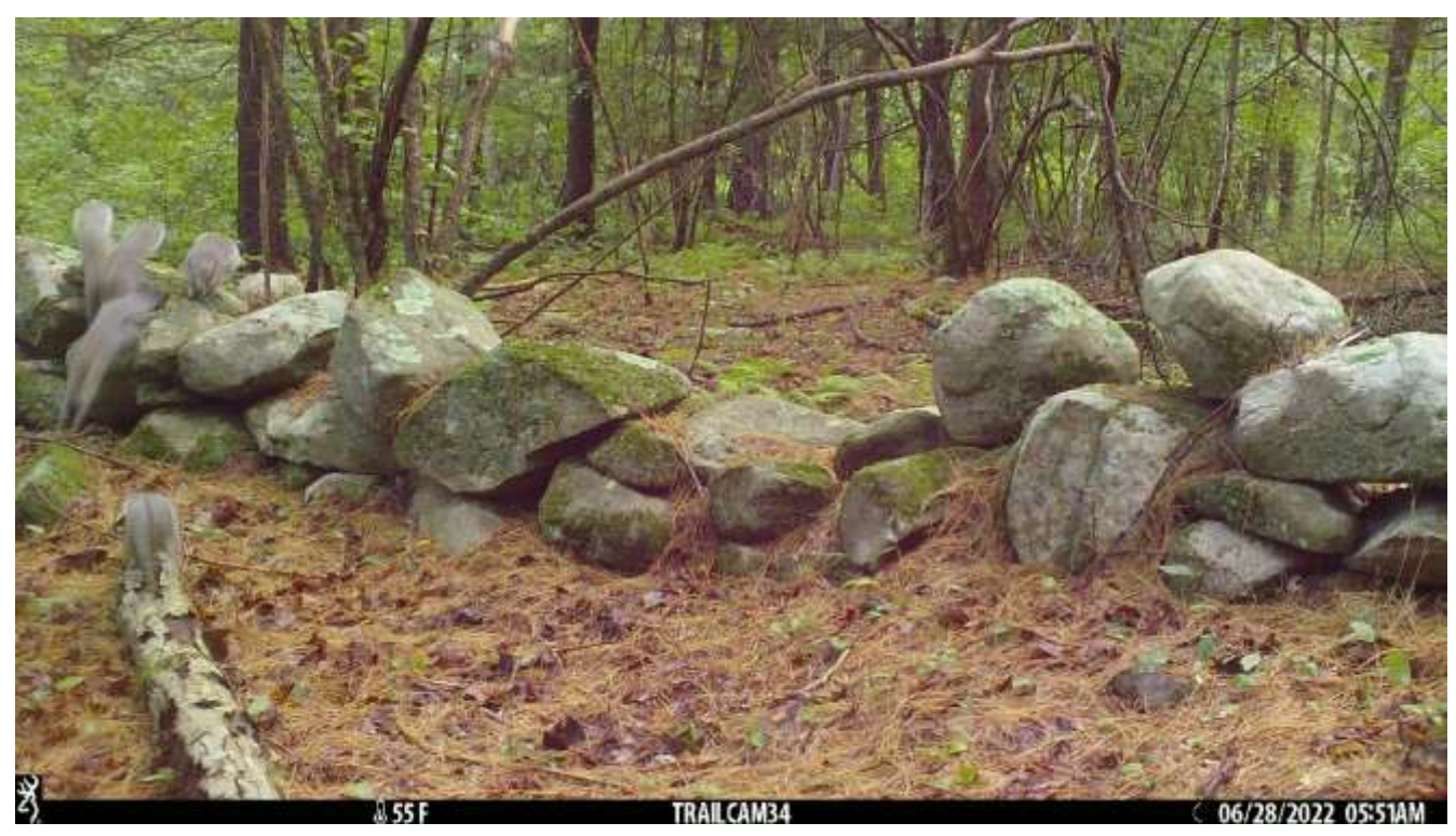
Grey squirrel party!