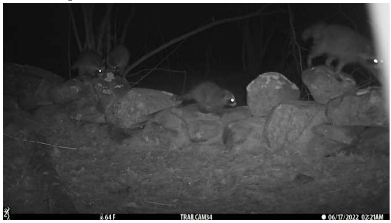
Mother raccoon and her kits