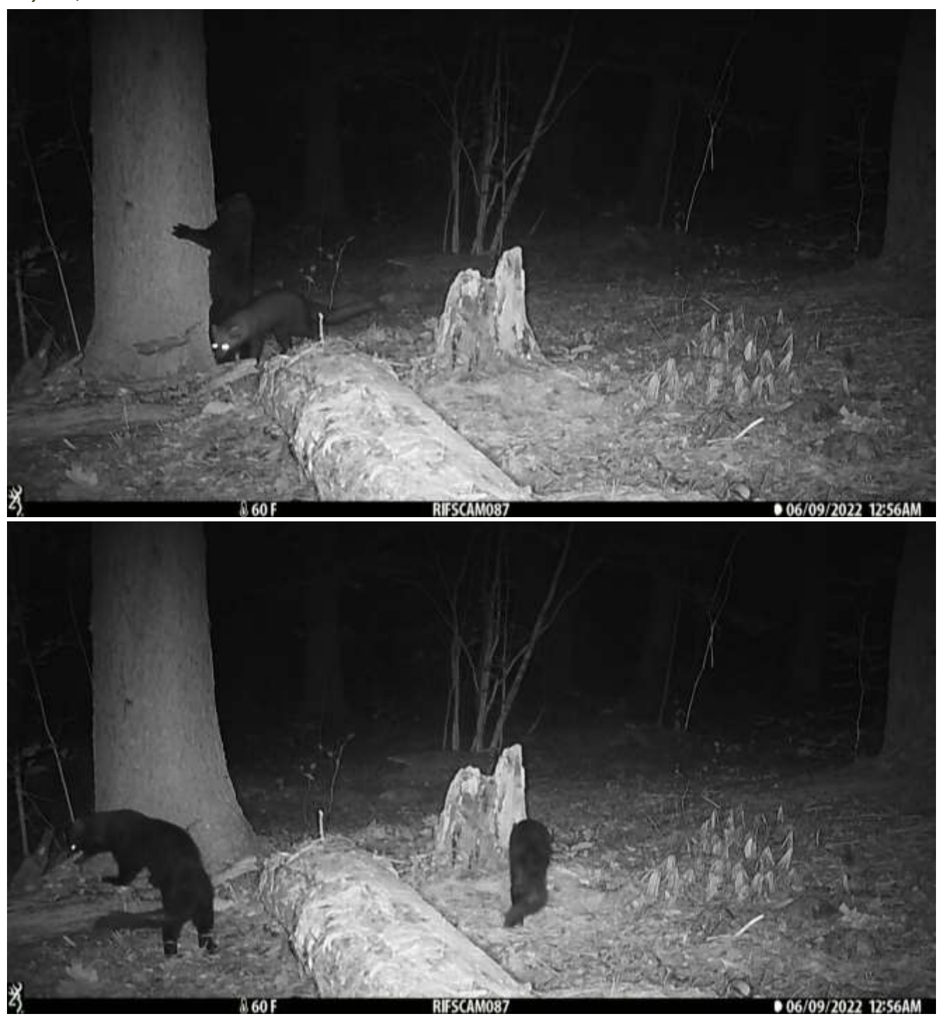
Adult male fisher and juvenile male fisher

Species detected: birds, grey squirrel, eastern chipmunk, red squirrel, white-tailed deer, mice, fisher, long-tailed weasel, raccoon, Virginia opossum, flying squirrel, turkey, coyote, mink