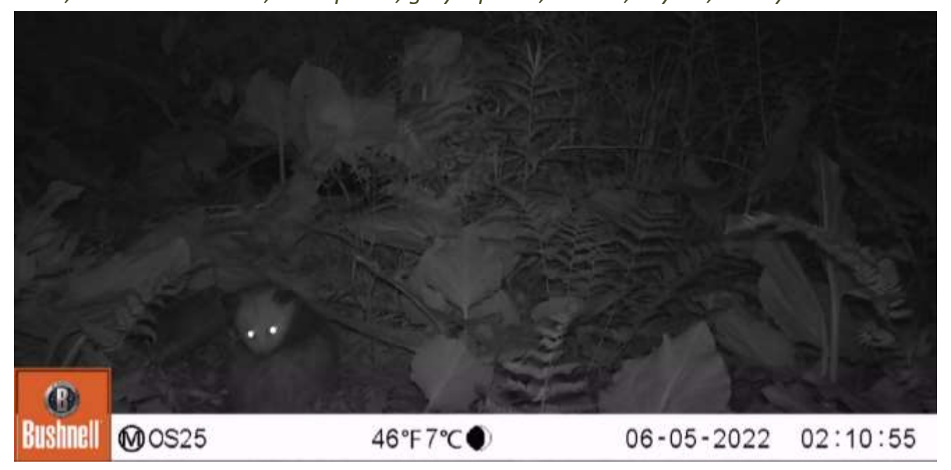
Virginia opossum scratching an itch or pretending it's Dracula, you decide!

Species detected: Virginia opossum, raccoon, long-tailed weasel, white-tailed deer, birds, eastern cottontail, red squirrel, grey squirrel, bobcat, coyote, turkey