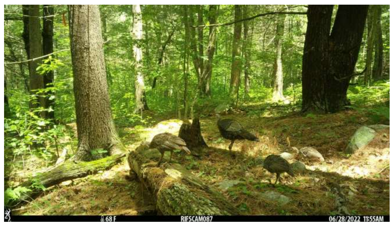
Turkey with her poults