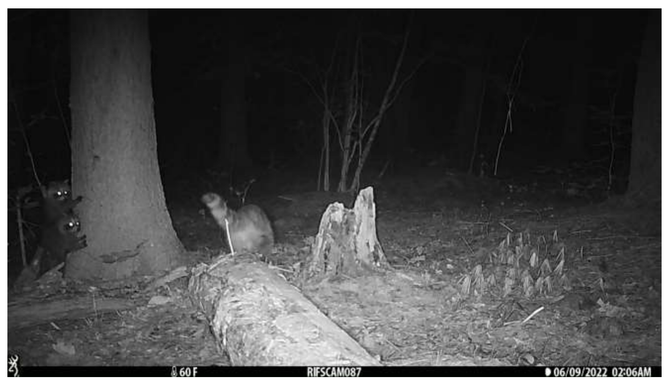
Mother raccoon with her two kits