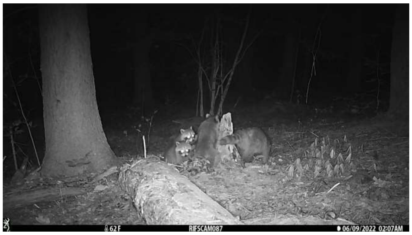
Mother raccoon with her three kits