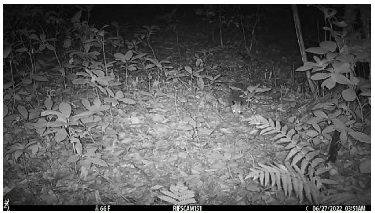
Juvenile Virginia opossum