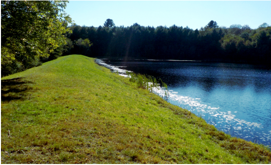
Maurie Dunbar Acres

The Foster Land Trust invites you to explore their properties in the following locations: