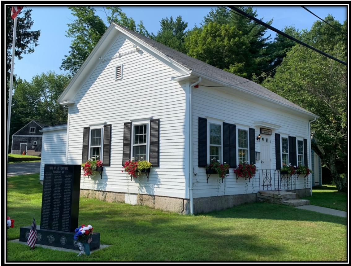
BENJAMIN EDDY BUILDING: BY SUSAN SPRAGUE